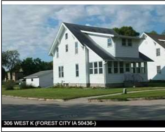
306 WEST K (FOREST CITY IA 50436-)

PIN: 1135285004 Route: FC0-005-935 Deedholder: SEGER CHRISTOPHER L & KARI L Address: 306 W K ST Map Area: Forest City Corp Subdivision: FC (ORIGINAL TOWN) Tax District: Forest City Corporation Land SF: 6,600 Total Acres: 0.152