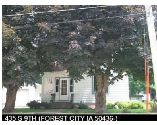
435 S 9TH (FOREST CITY IA 50436-)

PIN: 1135408009 Route: FC0-007-300 Deedholder: TAPIA KEVIN & BRIANNA D Address: 435 S 9TH ST Map Area: Forest City Corp Subdivision: FC (ORIGINAL TOWN) BLK 76 Tax District: Forest City Corporation Land SF: 8,712 Total Acres: 0.200