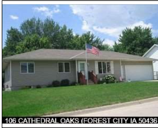
106 CATHEDRAL OAKS (FOREST CITY IA 50436)