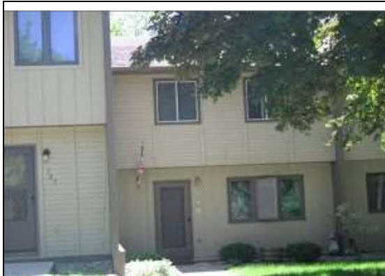
129 SWEETGRASS LN (FOREST CITY IA 50436-)

PIN: 1126479013 Route: FC0-002-420 Deedholder: VOLSEN JOSHUA M Address: 129 SWEETGRASS LN Map Area: Forest City Corp Subdivision: INDIAN SPRINGS 1ST Tax District: Forest City Corporation Land SF: 2,647 Total Acres: 0.061