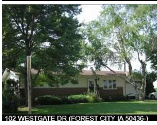
102 WESTGATE DR (FOREST CITY IA 50436-)

Buyer: PROVENZANO FAMILY CONSTRUCTION LLC Seller: H & R PROPERTIES LLC Sale $/TLA: $42.22