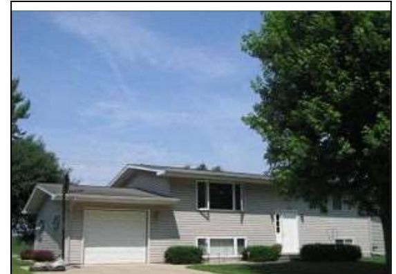
106 WESTHAVEN DR (FOREST CITY IA 50436-)