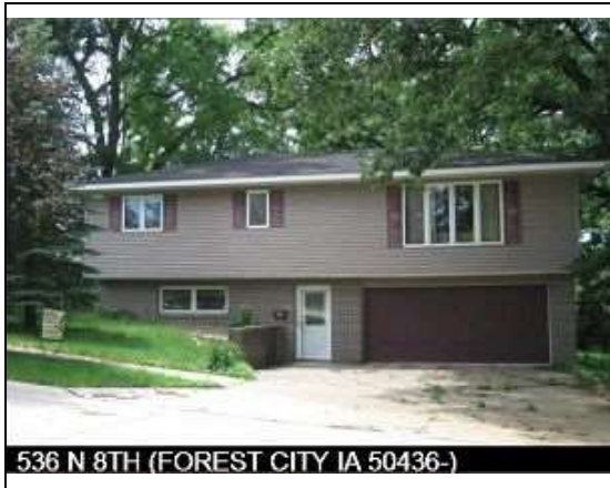
536 N 8TH (FOREST CITY IA 50436-)

PIN: 1135208004 Route: FC0-004-205 Deedholder: BRANDT ASHLYN N & BEARD RYAN I Address: 536 N 8TH ST Map Area: Forest City Corp Subdivision: FC (ORIGINAL TOWN) Tax District: Forest City Corporation Land SF: 10,890 Total Acres: 0.250