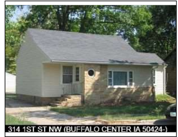
314 1ST ST NW (BUFFALO CENTER IA 50424-)