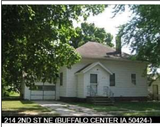
214 2ND ST NE (BUFFALO CENTER IA 50424-)

PIN: 0517382002 Route: BC0-001-355 Deedholder: WINNKO LLC Address: 214 2ND ST NE Map Area: Buffalo Center Corp Subdivision: BC (ORIGINAL TOWN) Tax District: Buffalo Center Land SF: 8,800 Total Acres: 0.202