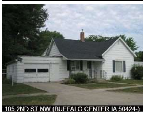
105 2ND ST NW (BUFFALO CENTER IA 50424-)

Buyer: WINNKO LLC Seller: ORANGES LLC Sale $/TLA: $39.06