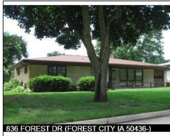
836 FOREST DR (FOREST CITY IA 50436-)