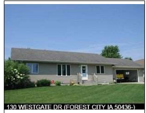
130 WESTGATE DR (FOREST CITY IA 50436-)