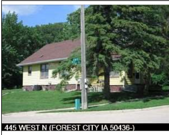
445 WEST N (FOREST CITY IA 50436-)

PIN: 1135208005 Route: FC0-005-305 Deedholder: PROVENZANO FAMILY CONSTRUCTION Address: 445 W N ST Map Area: Forest City Corp Subdivision: FC (ORIGINAL TOWN) Tax District: Forest City Corporation Land SF: 9,801 Total Acres: 0.225