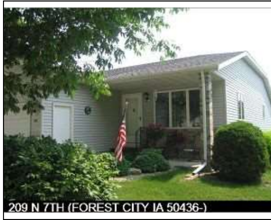
209 N 7TH (FOREST CITY IA 50436-)