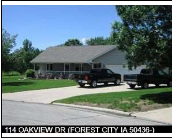
114 OAKVIEW DR (FOREST CITY IA 50436-)

PIN: 1126429019 Route: FC0-002-565 Deedholder: KORTH AARON & SHELBY Address: 114 OAKVIEW DR Map Area: Forest City Corp Subdivision: RAINBOW VALLEY Tax District: Forest City Corporation Land SF: 26,575 Total Acres: 0.610