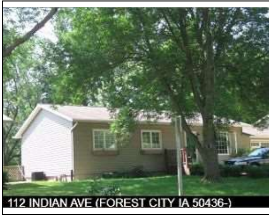
112 INDIAN AVE (FOREST CITY IA 50436-)

PIN: 1135356006 Route: FC0-010-570 Deedholder: OLSON BRYON J & BRANDI M Address: 112 INDIAN AVE Map Area: Forest City Corp Subdivision: WESTGATE 2ND Tax District: Forest City Corporation Land SF: 7,700 Total Acres: 0.177