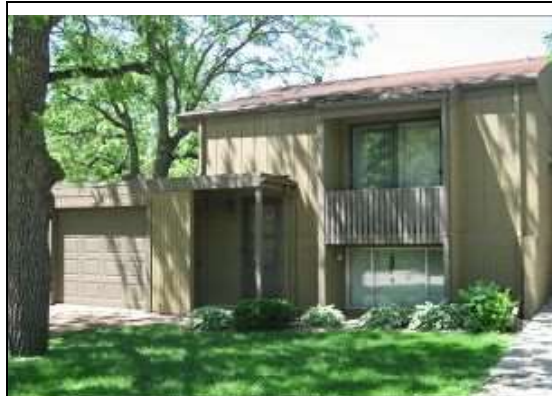
128 SWEETGRASS LN (FOREST CITY IA 50436-)