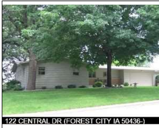
122 CENTRAL DR (FOREST CITY IA 50436-)