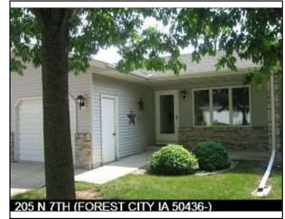
205 N 7TH (FOREST CITY IA 50436-)