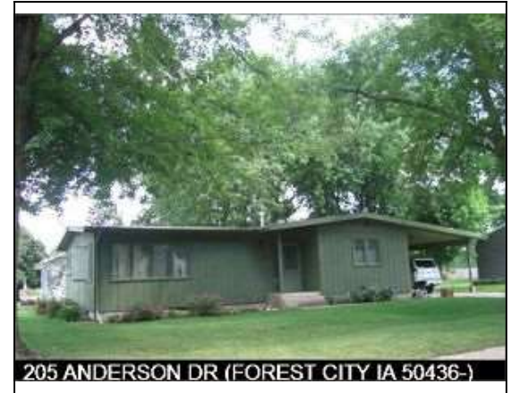
205 ANDERSON DR (FOREST CITY IA 50436-)